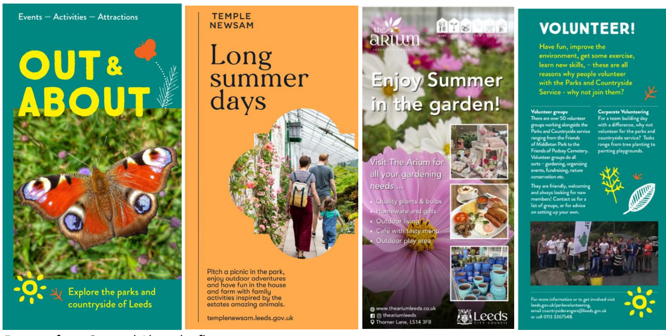
Extracts from Out and About leaflet

2.25 Four heritage interpretation signs were installed at Tulip Street green space in South Leeds which are eventually to form part of a South Leeds heritage trail incorporating Cross Flatts park where the installation of new history signs is due to take place shortly.