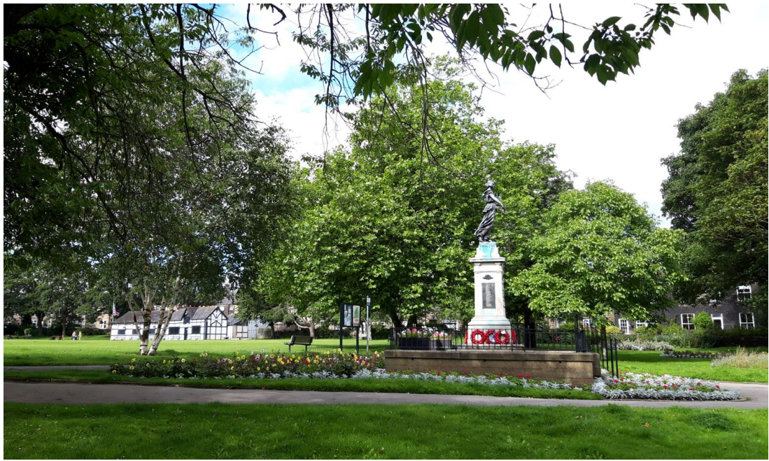
Calverley community park achieved LQP in 2023