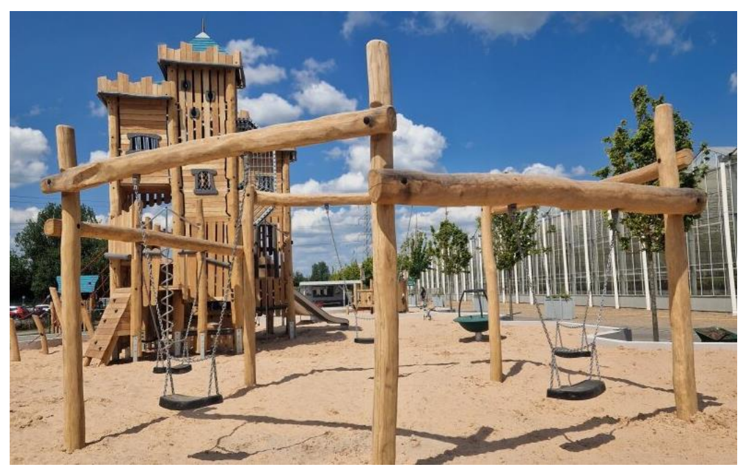
New playground at the Arium

2.36 <u>Health and Wellbeing priority</u> - Providing and promoting a wide range of opportunities for people to get the health benefits of spending time in green spaces