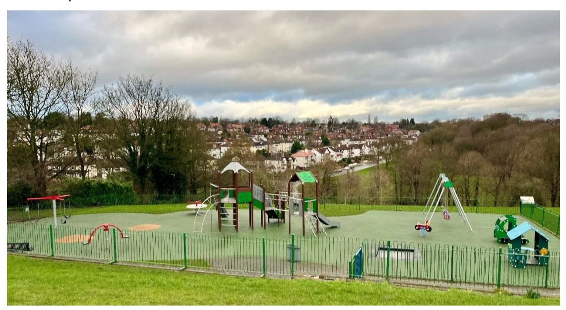
Newly refurbished play area at Chapel Allerton park