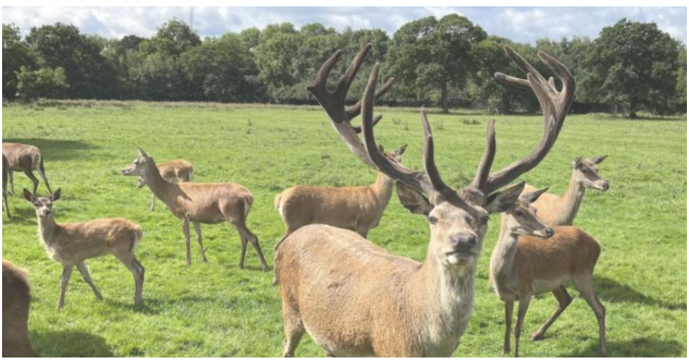
Deer at Lotherton