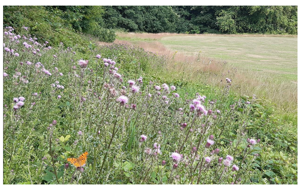
Butterfly conservation area cultivated in Roundhay park in 2023.