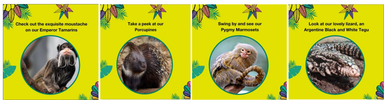
Animals newly introduced to Tropical World in 2023.