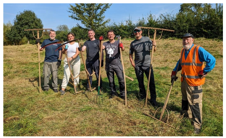
Corporate volunteers hay raking at Asket Hill, Sept 2023

unrecorded hours to caring for public parks and green spaces in the city through activities such as litter picking, fundraising and organising events.