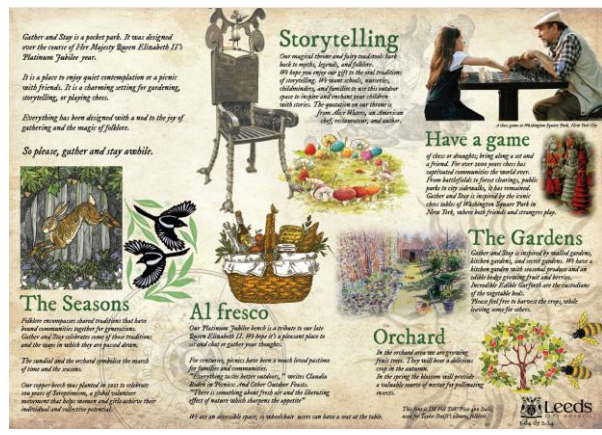
Information about the new 'Gather and Stay' space at Barley Hill park