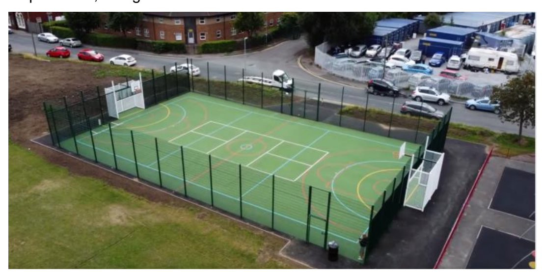
New multi-use games area at Hunslet Moor, installed summer 2023.

2.37 Investment in sports facilities in 2023 included the installation of a new Multi Use Games Area at Hunslet Moor, a trim trail at Pepper Road, a table tennis table at Yeadon Tarn and non-turf cricket pitches at Roundhay park and Bedquilts. Several other large-scale, community-led schemes still under construction include new rugby pavilions at Stonegate Road (North Leeds Leopards Rugby) and Butt Lane (Farnley Falcons Rugby) and an extension on the changing rooms at West Leeds Rugby League Club in Armley. Investment for these facilities has come from various sources including the English Cricket Board (ECB), Sport England, Rugby World Cup Legacy Fund, local ward members, S106 and Landfill providers, along with contributions from the clubs themselves.