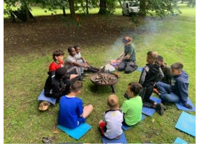
Bushcraft at Hunslet Moor (part of Healthy Holidays), summer 2023